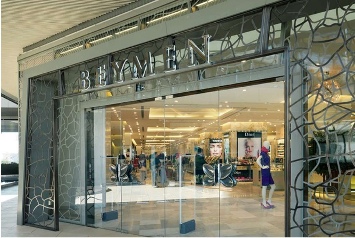
The Beymen flagship at the Zorlu Center in Istanbul.